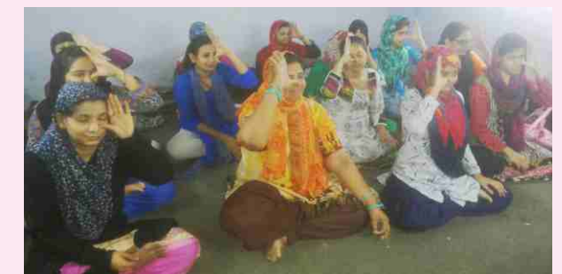
21 June - Int'l Day of Yoga was celebrated at all 40 BYPL Mahila Shiksha Kendra

As June 26 - Int'l day against Drug Abuse fell on a holiday - on June 28, with NGO SPYM (Society for Promotion of Youth & Masses) BYPL conducted an awareness session on the ill effects of drug abuse at its Health Camp.