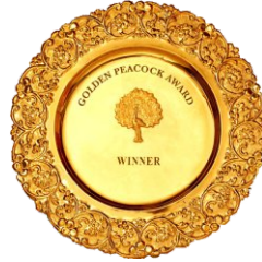
Golden Peacock Awards

The award has a very stringent evaluation criterion and it will be presented in a virtual ceremony. It was