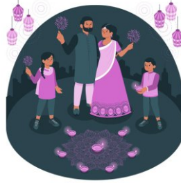
Celebrate festivals virtually